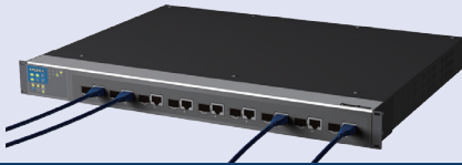
PT-G7509-F series (Front Cabling, Front Display)