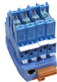
Relay module in i-7000 (2)